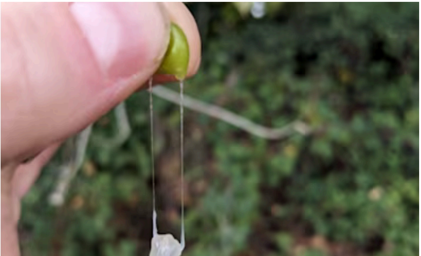
Sticky residue being squeezed from a mistletoe berry